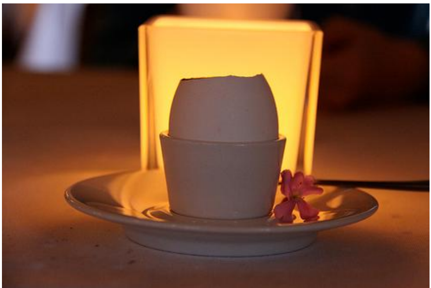
Crème Brûlée Served in an Egg, Fridrik V, Iceland