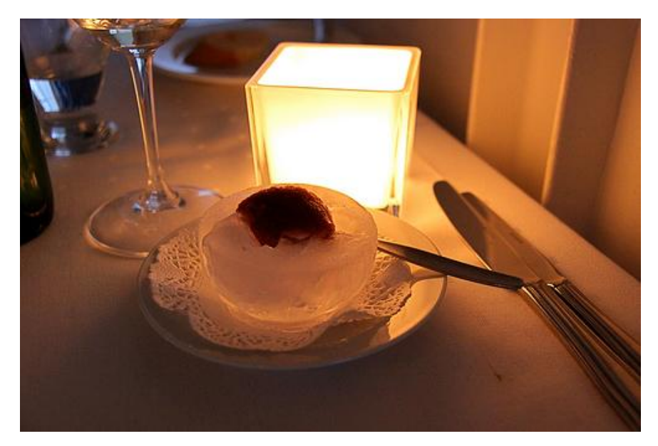
Sorbet on block of ice, Fridrik V, Iceland