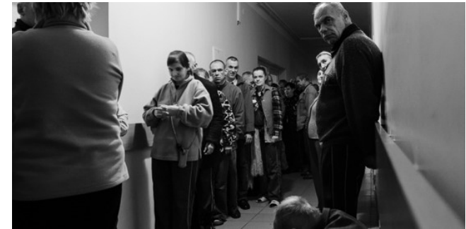
Human rights approach