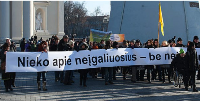
Active civil society