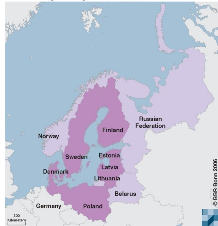
Baltic Sea Region - Programme area 2007 - 2013

■ EU regions/member states ■ non-EU member states