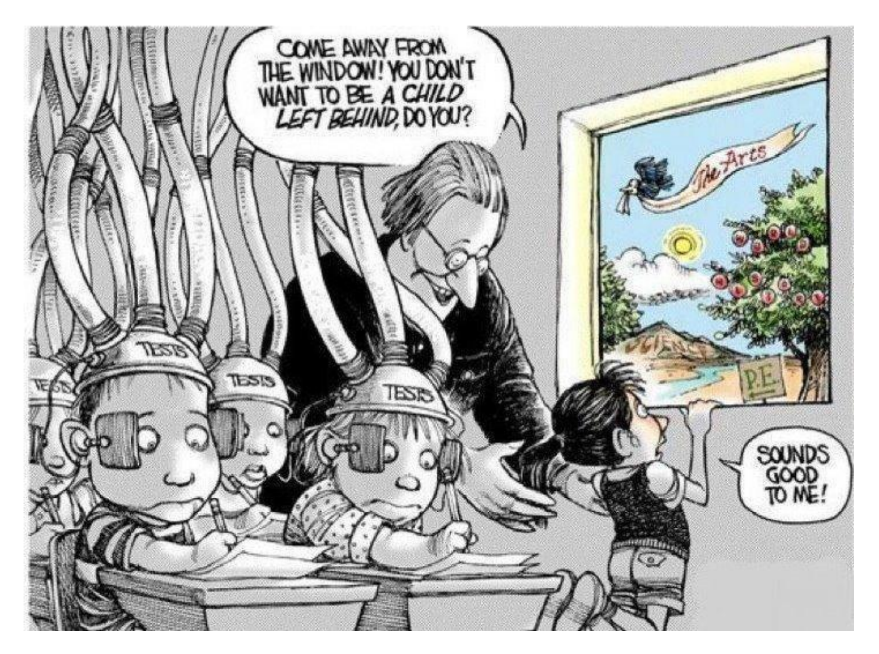
fks \ | \ \text{Norwegian Federation for Arts in Education} \ | \ www.fellesradet\text{-}fks.no